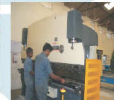
Press Brake Machine : For banding of reflector panel.