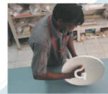
Microwave Antenna Assembly