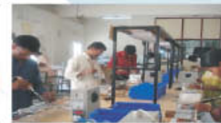
BTS Antenna Networking