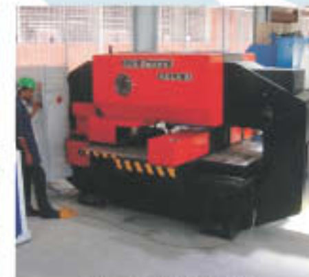
Turret Punch Machine : For punching of holes on reflector panel.