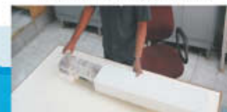
BTS Antenna Radom Fixing