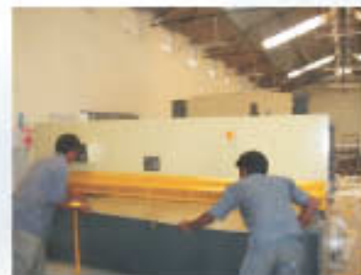
Shearing Machine: For cutting Aluminium / MS Plates into required sizes.