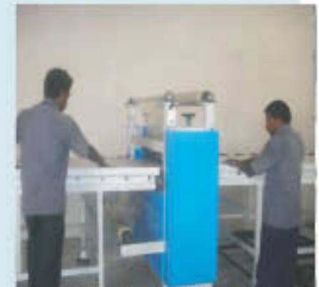
Film Covering Machine : For covering aluminium sheet with self adhesive film.