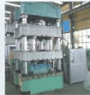
Hydraulic Press Machine: For forming of dish profile.