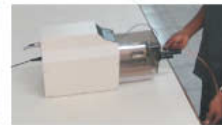
Cable Stripping Machine : For stripping the co-axial cables.