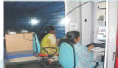
IM3 testing using Passive Inter-modulation Analyzer