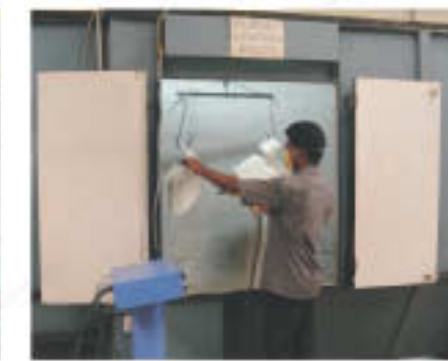
Powder Coating Unit