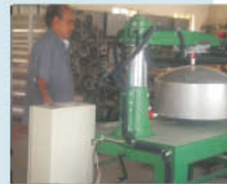
Shroud Cutting Machine : For trimming of shroud.